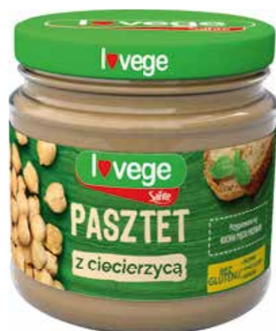
VEGETARIAN PÂTÉ WITH CHICKPEAS