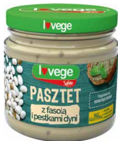
VEGETARIAN PÂTÉ WITH BEANS