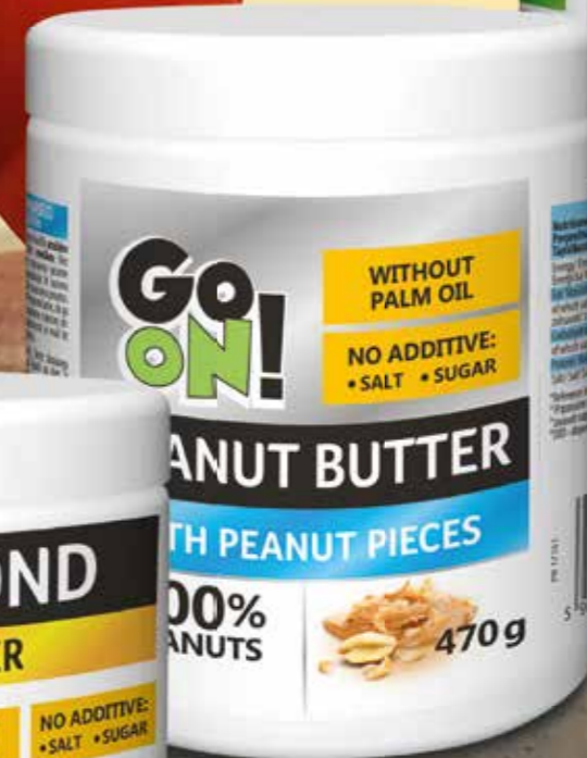
PEANUT BUTTER WITH PEANUT PIECES