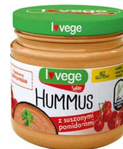
HUMMUS WITH SUN-DRIED TOMATOES