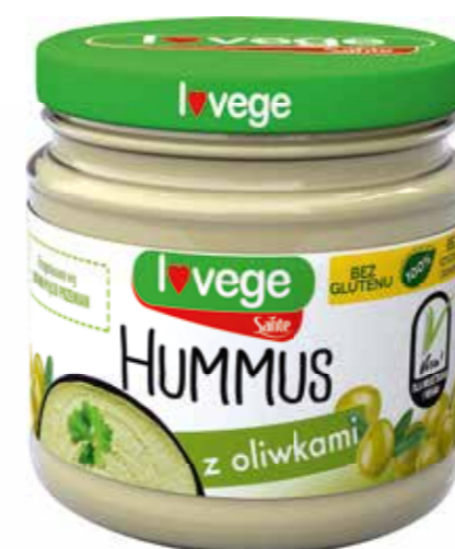
HUMMUS WITH OLIVES