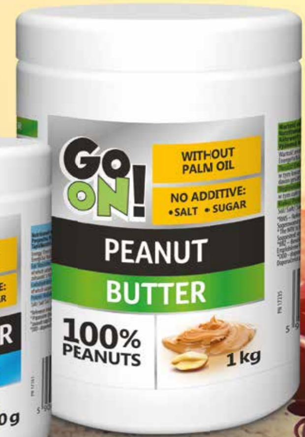
PEANUT BUTTER, VELVET TEXTURE