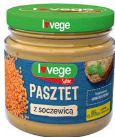
VEGETARIAN PÂTÉ WITH LENTILS