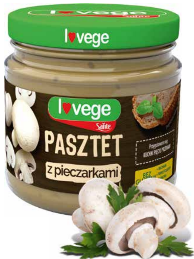
VEGETARIAN PÂTÉ WITH MUSHROOMS

LOVEGE are creamy, delicious products based on the valuable grains, leguminous vegetables with the addition of vegetables and natural flavourings.